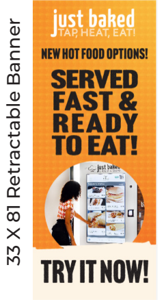
33 X 81 Retractable Banner

Just Baked Launch Kit items are available for order through Vista print by clicking 'ORDER HERE' Above